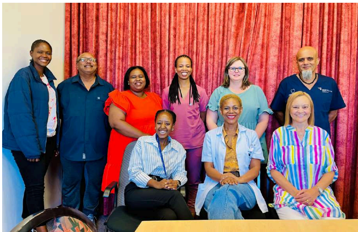
Critical Reflection with the Dental Sciences Staff

These developments reflect CPUT's commitment to maintaining high academic standards and accountability in higher education.