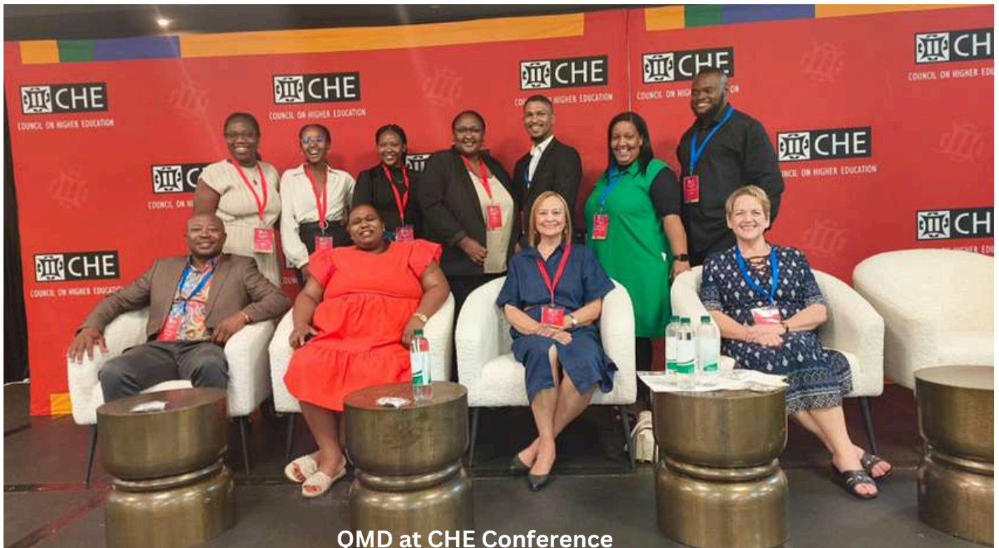
QMD at CHE Conference