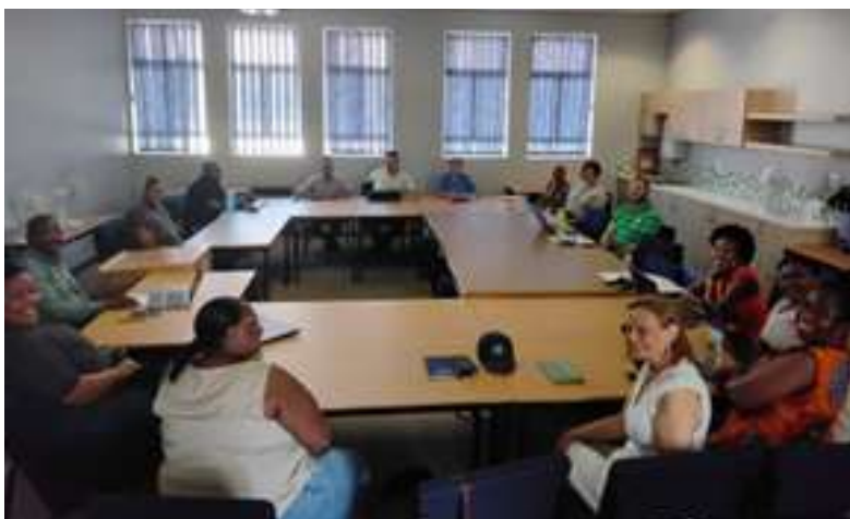
SP Staff Engagement - Wellington Campus

The QMD's engagement sessions underscored the importance of collaboration, transparency, and accountability in upholding quality across CPUT. These achievements serve as a beacon of excellence, inspiring the entire academic community to strive for ongoing success and improvement.