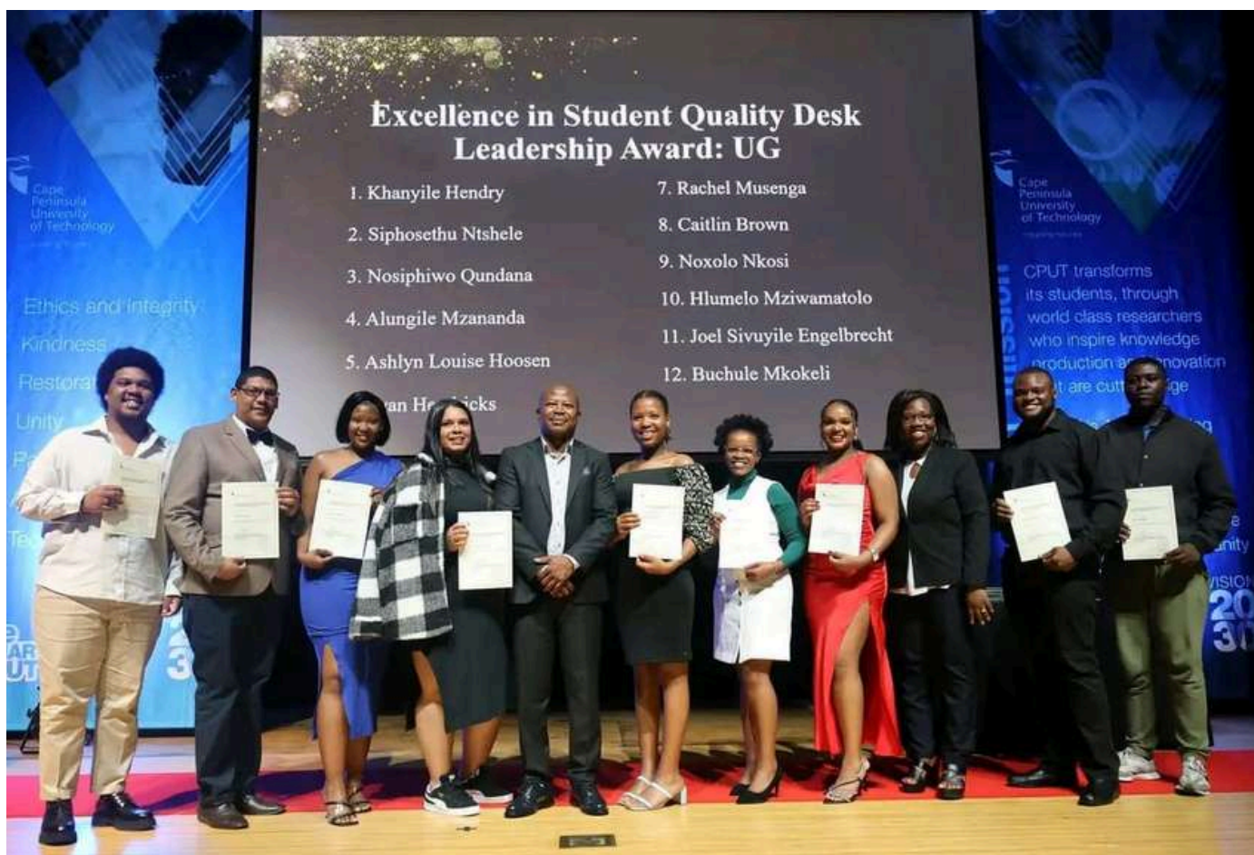
Celebrating Students Excellence in Leadership

For Qualification Reviews, departments that exceeded the threshold were recognised, with 14 departments receiving awards across 10 categories for 2023 and 2024. Similarly, in QIPs, 26 departments maintaining a Blue Flag status were awarded for sustained excellence. The awards successfully celebrated quality-driven achievements across CPUT.