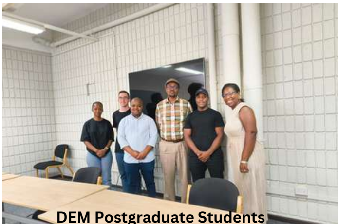
DEM Postgraduate Students

On 13 March, undergraduate DEM students reflected on their experiences. Students appreciated the teaching methodologies used by lecturers and the availability of study guides and lesson materials that support their academic success.