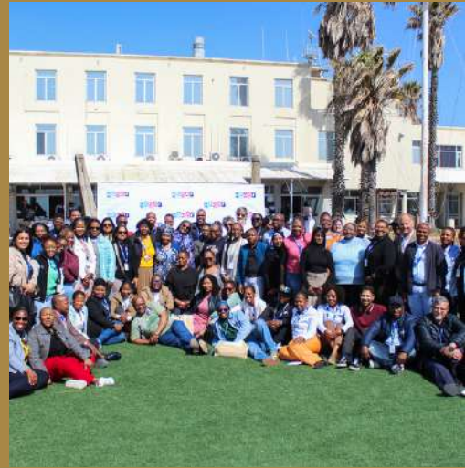
HEQAF Delegates in a Group Picture

The HEQAF highlighted the evolving role of technology, leadership, and student engagement in transforming quality in higher education, reinforcing the need for collaboration and continuous improvement