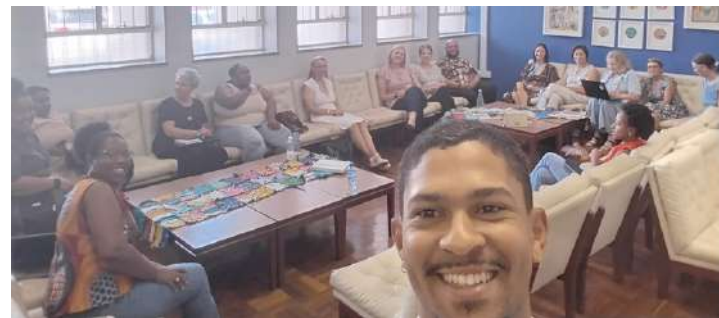
FP Staff Engagement - Wellington Campus