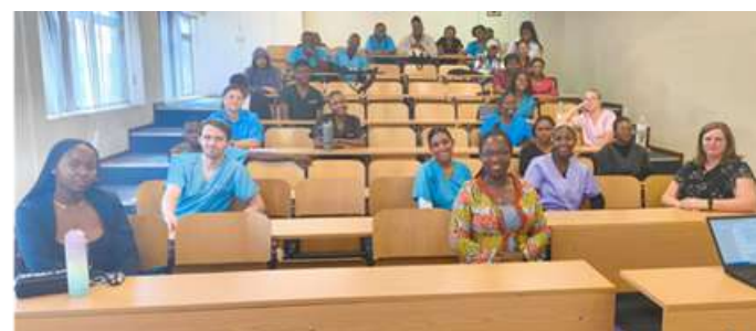
Dental Sciences Students Critical Reflection