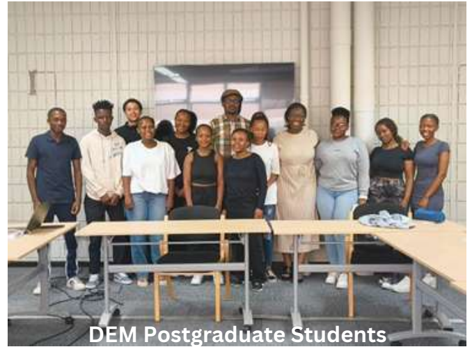
DEM Postgraduate Students

The postgraduate DEM session on the same day highlighted strong supervisor support, timely assessment feedback, and structured programme coordination. However, students cited challenges with campus Wi-Fi and digital platform access. These reflections play a crucial role in shaping institutional improvements, reinforcing the commitment to student-centered quality assurance.