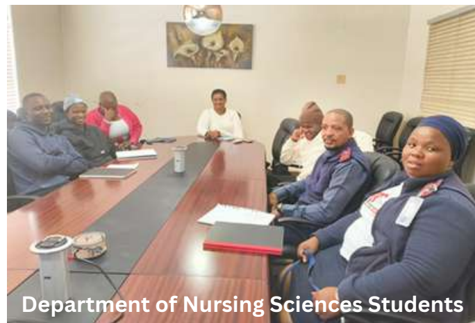
Department of Nursing Sciences Students

During the Dental Sciences student critical reflection session, students praised the expertise and dedication of lecturers, acknowledged the strong academic support structures, and appreciated the flexibility of staff who offer extra assistance outside regular hours.