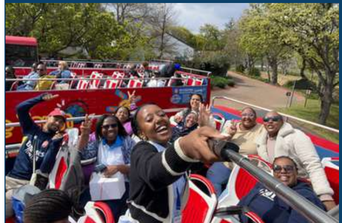
HEQAF Delegates in a Red Bus Tour