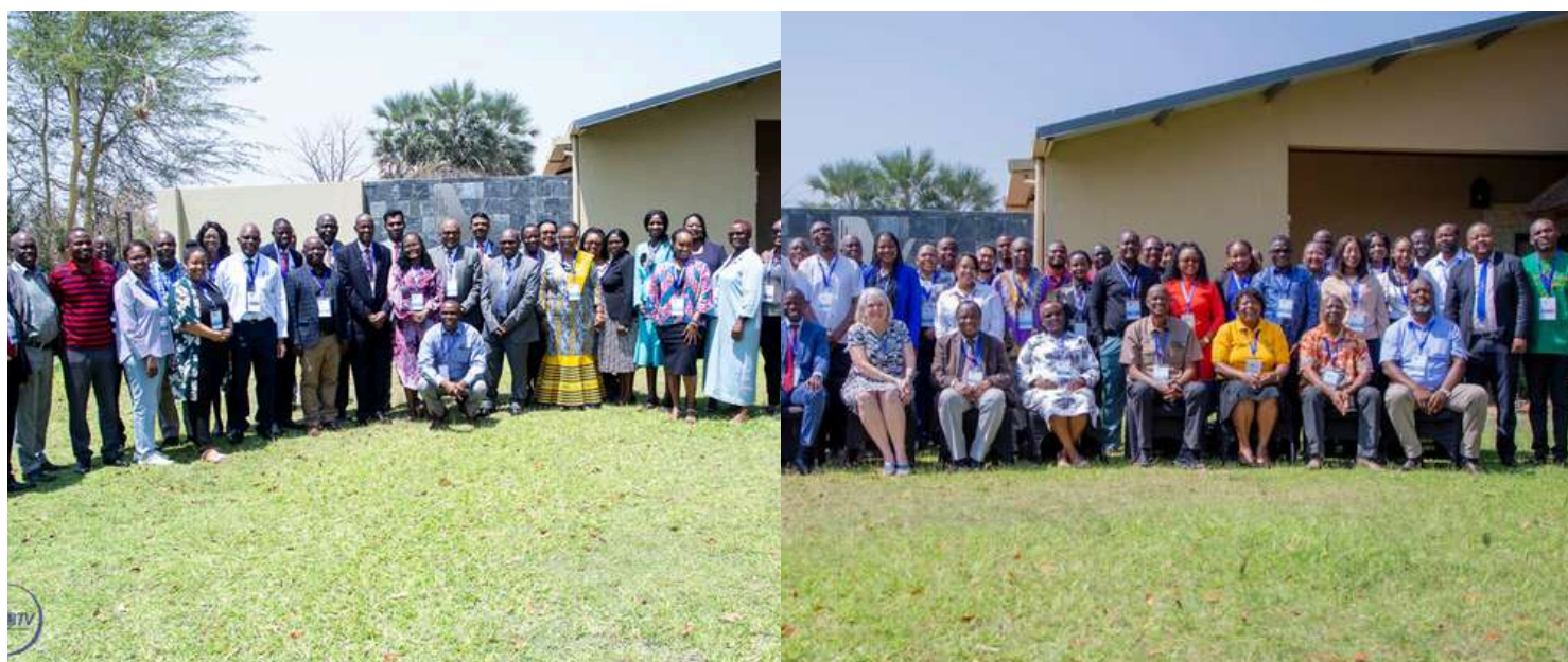
QMD attends SAQAN Conference